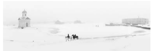
Pentti Sammallahti Solovki, Mar Bianco, Russia, 1992 Gelatin Silver Print, 20/25x40 cm