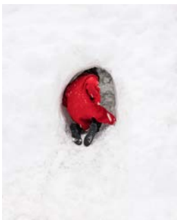
Cig Harvey, Igloo, 2018 Chromogenic dye coupler print 51 x 41 cm, Edition of 10