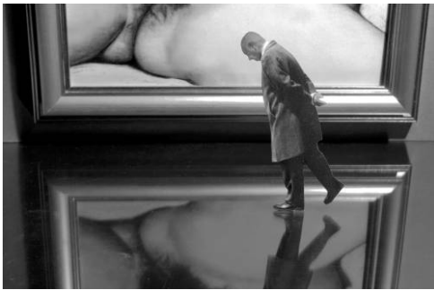
Gilbert Garcin L'indifférent, 2006 Gelatin Silver Print, 30x40 cm, 6/12