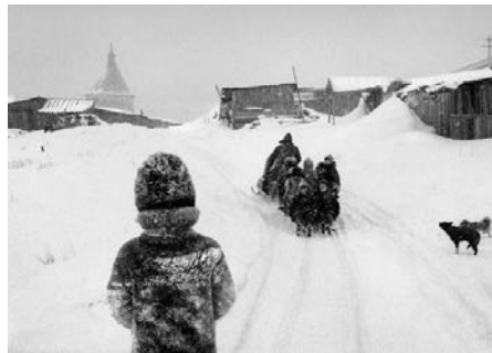
Pentti Sammallahti Solovki, Mar Bianco, Russia, 1992 Gelatin Silver Print, circa 20x25 cm