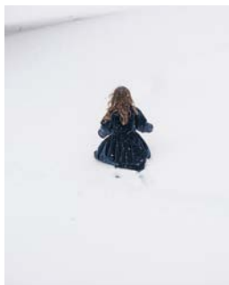
Cig Harvey, Scout During Skylar, 2018 Chromogenic dye coupler print 51 x 41 cm, Edition of 10