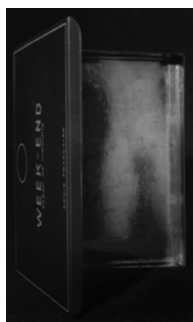
Alain Fleischer, Week-End, 1982 Vintage Gelatin Silver Print 54,9x38,3 cm, 4/10