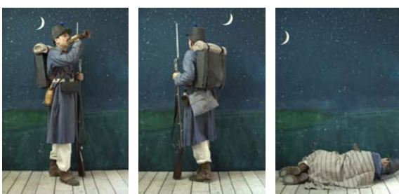
Paolo Ventura The Last Dream Archival Pigment Print, (3 x 60x40 cm) , edition of 5