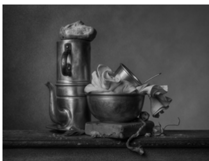
Christopher Broadbent Moka II, 2018 Archival Pigment Print, 28x39 cm, 2/5