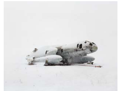
Danila Tkachenko Airplane – amphibian with vertical take-off VVA14 , 2013 Archival Pigment Print, 72x90 cm, 6/6