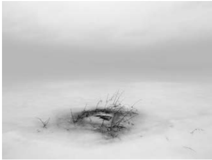
Pentti Sammallahti Gotland, Svezia, 1997 Archival Pigment Print, circa 42x59 cm