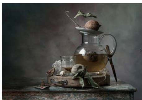
Christopher Broadbent Scullery II, 2012 Archival Pigment Print, 38x55 cm, 1/4