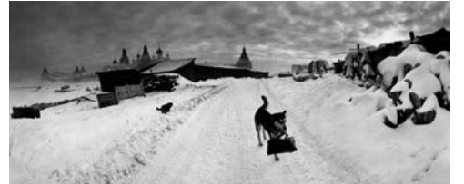
Pentti Sammallahti Solovki, Mar Bianco, Russia, 1992 Gelatin Silver Print, 20/25x40 cm