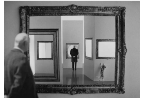
Gilbert Garcin Au musée, 1999 Gelatin Silver Print, 30x40 cm, 6/12

Galleria del Cembalo 12 febbraio – 14 marzo 2020 www.galleriadelcembalo.it