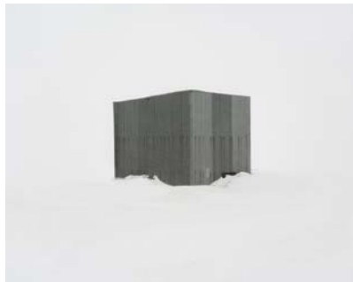
Danila Tkachenko Sarcophagus over a closed shaft, 4 km deep, 2013 Archival Pigment Print, 72x90 cm, 2/6