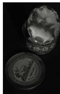
Alain Fleischer, Halva, 1982 Vintage Gelatin Silver Print 50x30 cm, 3/10