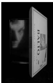
Alain Fleischer, Balto, 1982 Vintage Gelatin Silver Print 50x30 cm, 4/10