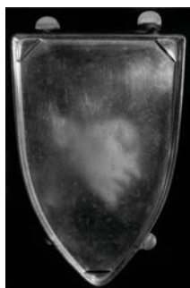
Alain Fleischer, L'empreinte du fer à repasser, 1982 Vintage Gelatin Silver Print 50x30 cm, 4/10