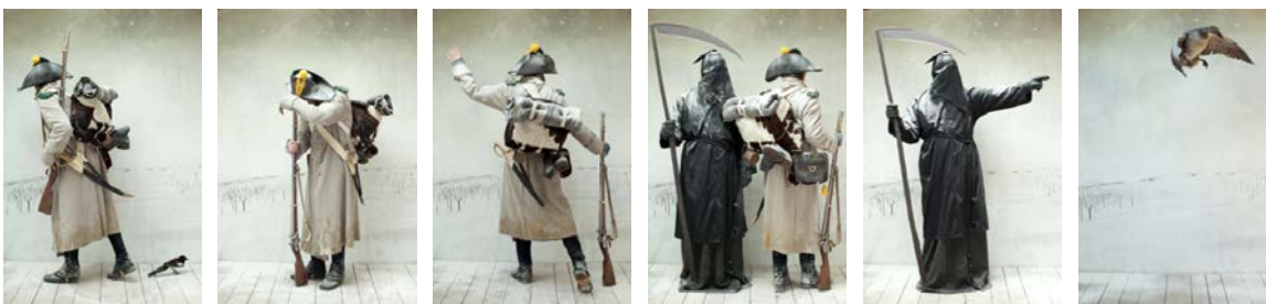
Paolo Ventura The Napoleonic Soldier Archival Pigment Print, (6 x 60x40 cm) , edition of 5