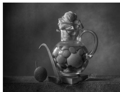
Christopher Broadbent Stones, 2019 Archival Pigment Print, 28x39 cm, 1/5