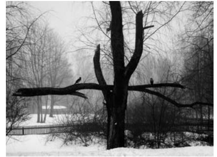
Pentti Sammallahti Helsinki, Finlandia, 1992 Gelatin Silver Print, 20x25 cm