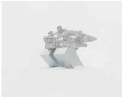
Danila Tkachenko Memorial on a deserted nuclear station, 2015 Archival Pigment Print, 72x90 cm, 6/6