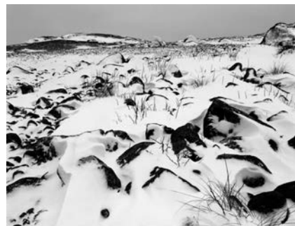
Pentti Sammallahti Jurmo, Finlandia, 1973 Archival Pigment Print, circa 42x59 cm