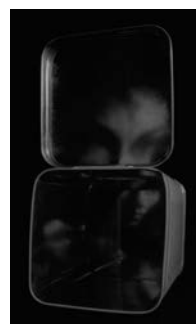
Alain Fleischer, Double Plan, 1981 Vintage Gelatin Silver Print 58,6x41,6 cm, 2/10