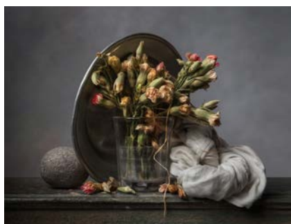
Christopher Broadbent Dry Flowers, 2019 Archival Pigment Print, 28x39 cm, 1/5