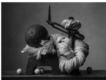
Christopher Broadbent Scarf, 2019 Archival Pigment Print, 28x39 cm, 1/5