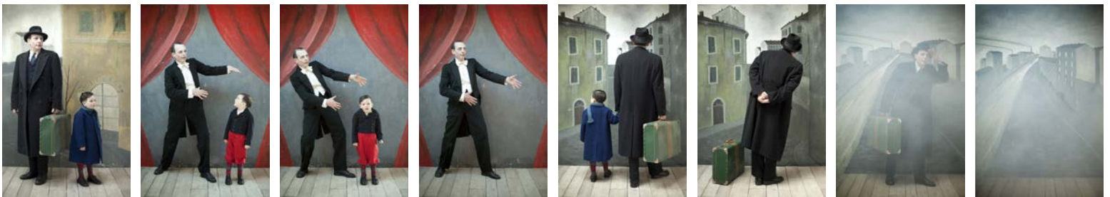
Paolo Ventura The Magician Archival Pigment Print, (8 x 60x40 cm) , edition of 5