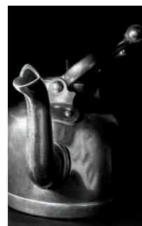
Alain Fleischer, La bouilloire, 1982 Vintage Gelatin Silver Print 50x30 cm, 4/10