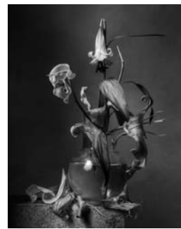
Christopher Broadbent Flowers XXX, 2012 Archival Pigment Print, 63x83 cm, 1/3