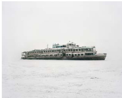
Danila Tkachenko "Bulgaria" ship lifted from underwater, 2014 Archival Pigment Print, 72x90 cm, 3/6