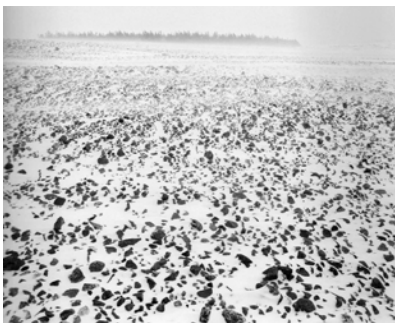
Pentti Sammallahti Jurmo, Finlandia, 1973 Archival Pigment Print, circa 42x59 cm