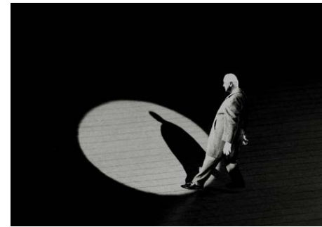
Gilbert Garcin La tentation, 2003 Gelatin Silver Print, 30x40 cm, 4/12