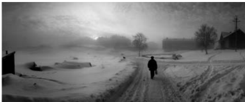
Pentti Sammallahti Solovki, Mar Bianco, Russia, 1992 Gelatin Silver Print, 20/25x40 cm