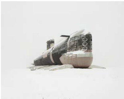
Danila Tkachenko The world's largest diesel submarine. 2013 Archival Pigment Print, 72x90 cm, Not for sale