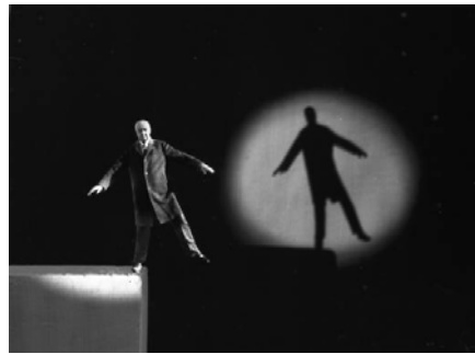
Gilbert Garcin Sortir de l'oubli, 2006 Gelatin Silver Print, 30x40 cm, 4/12